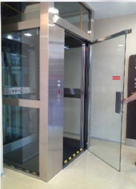
(Fig.2; Manual Swing Door Panel Finishes)

Applicable Model: PLM 300 - Car Size (900w x 1200d) - 300kg Rated Load PLM 355 - Car Size (1000w x 1400d) - 355kg Rated Load