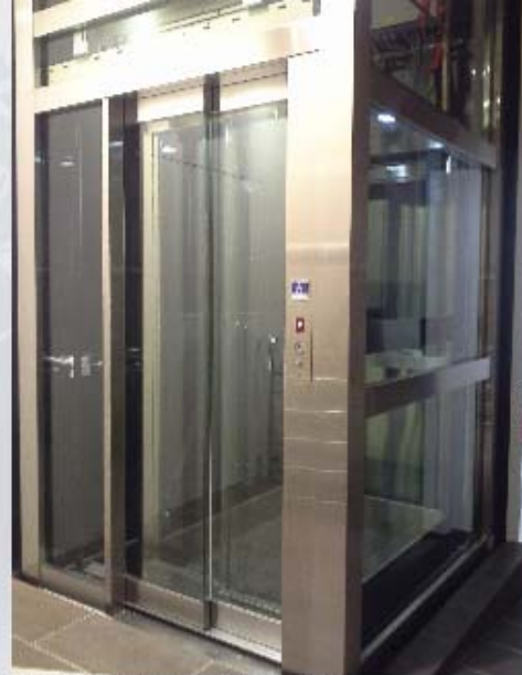
(Fig.1; Auto Sliding Door Panel Finishes)

Applicable Model: PLA 300 - Car Size (900w x 1200d) - 300kg Rated Load PLA 355 - Car Size (1000w x 1400d) - 355kg Rated Load